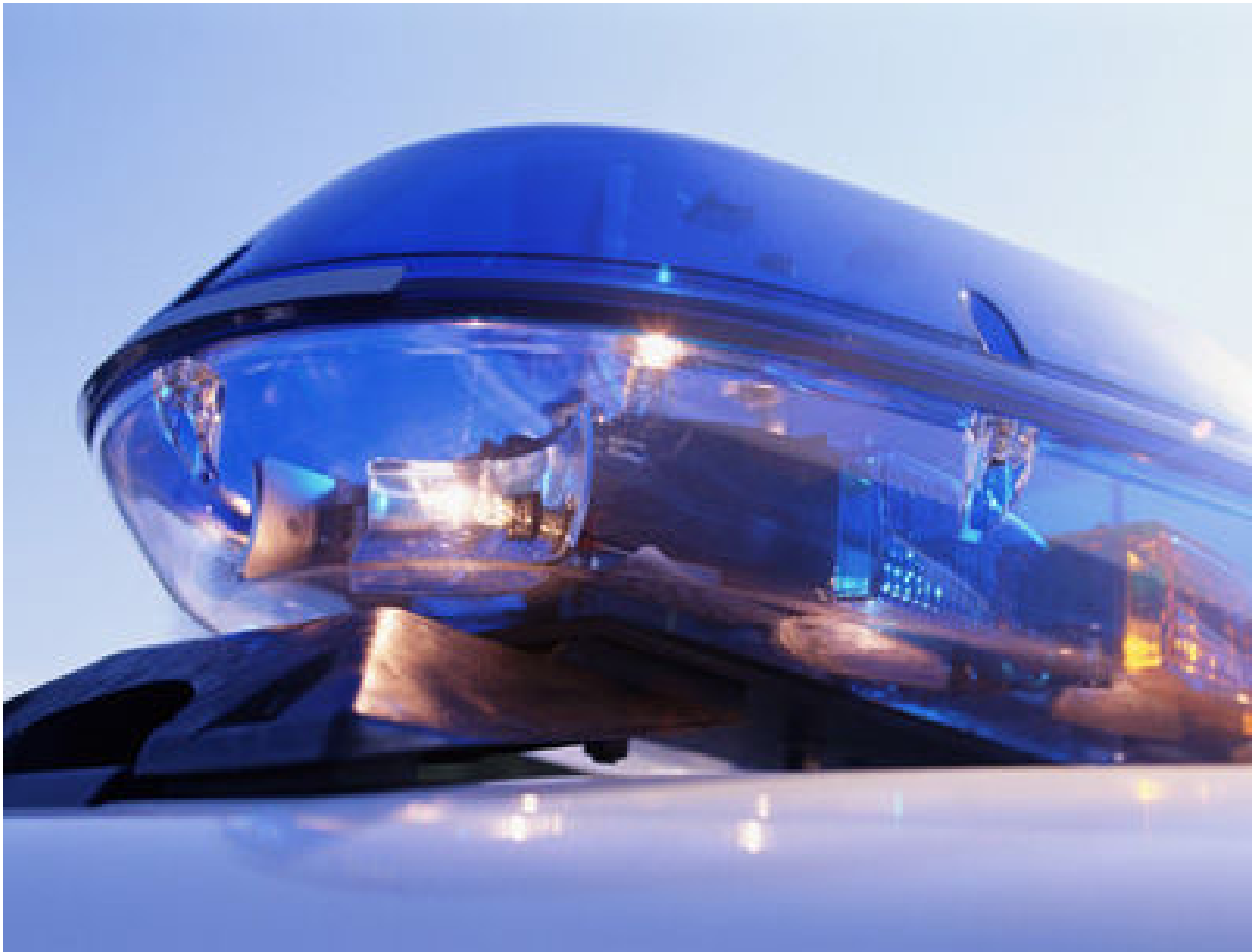
Close-up of emergency lights on police car

By Rachel Wittrock editor@jordannews.com 4 hrs ago